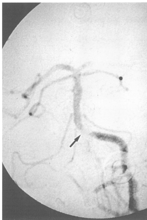
Figure 1 Angiogram of patient 5. (A) Left vertebral angiogram, anteroposterior view; a high grade stenosis is seen in the distal left vertebral artery at the C1 level (arrow). (B) Follow up angiogram two months after the initial PTA; the stenotic portion is now widely patent.