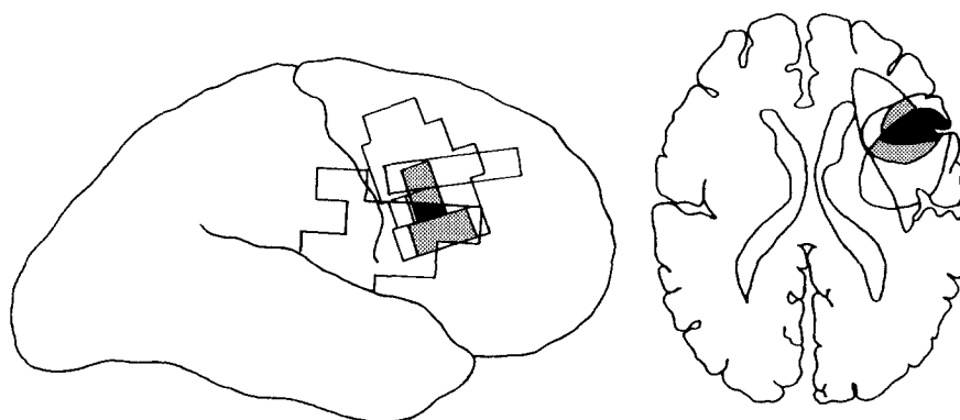
Fig. 2 Reconstruction of lesion sites on a lateral view of the brain and a sagittal section through the area of greatest overlap. The black area represents the region of overlap in four of five cases. The grey area shows the extent of overlap in three of five cases