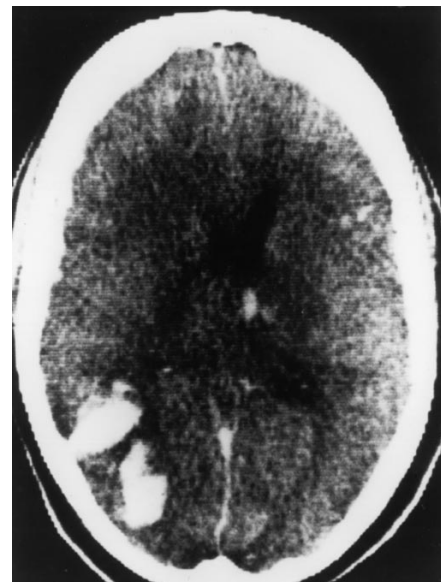
Fig. 3 Patient 3. Right parieto-temporo-occipital, right subdural, and smaller left frontal and subependymal hemorrhages

A 34-year-old woman presented with severe abdominal pain after 34 weeks of an uneventful pregnancy; she had had one earlier child and one therapeutic abortion. She had a blood pressure of 240/140 mmHg, hyperreflexia, and 4+ proteinuria. She had a generalized seizure, and was treated with magnesium and hydralazine. Laboratory studies indicated disseminated intravascular coagulation