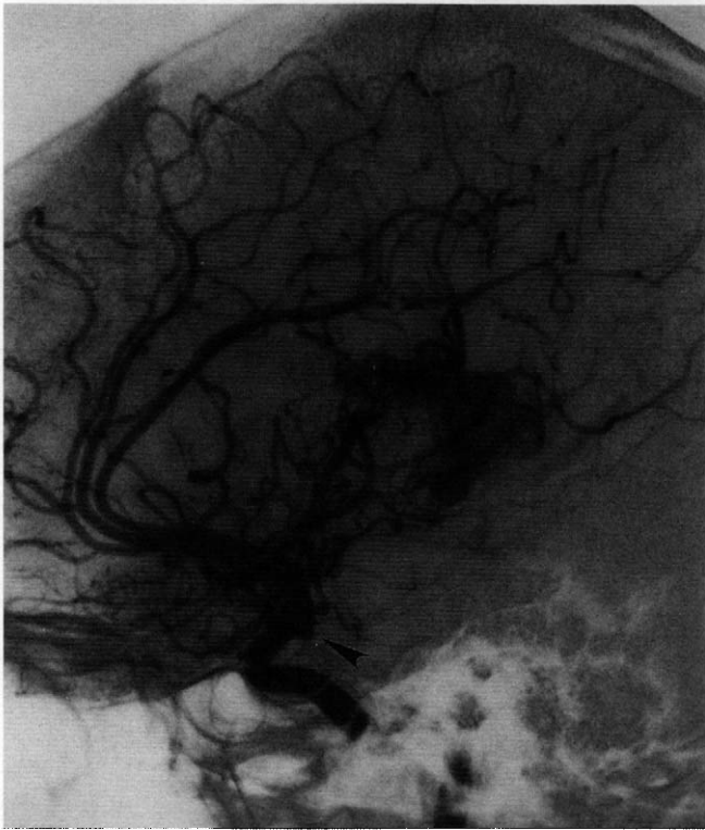
Figure 3. Case 2. Digital-subtraction, arterial phase, internal carotid cerebral angiogram illustrating arteriovenous malformation and posterior communicating artery aneurysm (arrowhead).

thalamus (Figure 2). On coronal images, there was extension into the subthalamic region. A cerebral angiogram showed a 4-mm aneurysm of the right posterior communicating artery (Figure 3) in addition to the arteriovenous malformation. She then underwent a right craniotomy with aneurysm clipping without complications. Postoperatively, she was started on phenytoin for seizure prophylaxis. On the fourth postoperative day, a neurologic consultation was obtained for new involuntary movements of her left hand. She reported that these movements were arrhythmic, not suppressible with restraint, and could occur any time during wakefulness. Examination showed mild chorea involving only the left hand and fingers, most prevalent while lightly grasping the examiner's fingers. She was unable to voluntarily suppress these movements. Serum phenytoin concentration was 18.0 \mu\text{g/mL} . Phenytoin was discontinued, and carbamazepine was started. The abnormal movements improved within 1 day of this medication change. The movements subsided after discharge, and the medication was eventually discontinued.