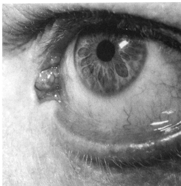
Figure 1. Biomicroscopic appearance of mucoepidermoid carcinoma of the caruncle.

Inquiries to Richard Rodman, MD, Wills Eye Hospital Cornea Service, 900 Walnut St, Philadelphia, PA 19107-5598; fax: (215) 928-3854.