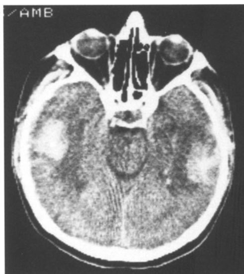
Fig. 1. CT of patient 2 revealed intracerebral haematoma localized bitemporally

An experimental model of the Kluver-Bucy syndrome was produced by bilateral removal of the temporal lobe in rhesus monkeys [1]. Simple extrapolation of symptoms encountered in animals to human pathology may be controversial. However, over 200 cases described in the literature indicate that the man-