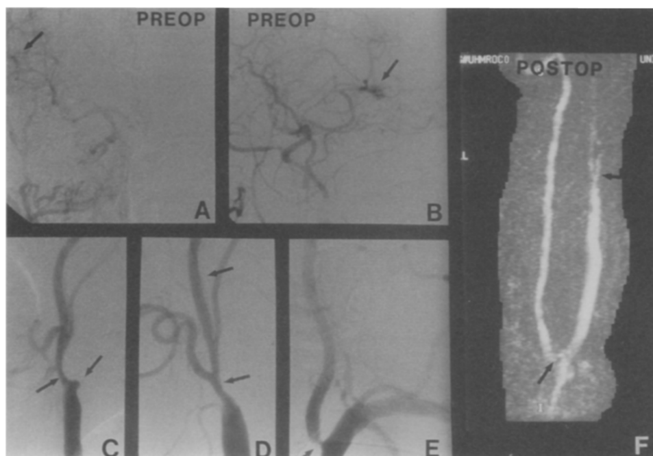
Fig. 1. Preoperative cerebral angiograms. A , Left EC-IC anastomosis at middle cerebral artery ( arrow ). B , Right EC-IC anastomosis at middle cerebral artery ( arrow ). C , Left external carotid stenosis ( arrow ) at cul de sac of occluded left internal carotid artery ( arrow ). D , Stenosis of right external carotid artery ( arrow ). E , Critical stenosis of left solitary vertebral artery ( arrow ). F , Postoperative magnetic resonance angiogram depicts transposition of vertebral artery to the side of common carotid artery ( lower arrow ). Upper arrow indicates branching of external carotid artery.

Fig. 2). The common and external carotid arteries were endarterectomized, and the internal carotid cul de sac was resected. The vertebral artery was transected at its origin and was transposed to the endarterectomized common carotid artery after spatulation. Saphenous vein patch angioplasty of the external carotid artery and carotid bifurcation was performed with running 6-0 prolene (Fig. 3). The preoperative global ischemia and syncope resolved after the operation.