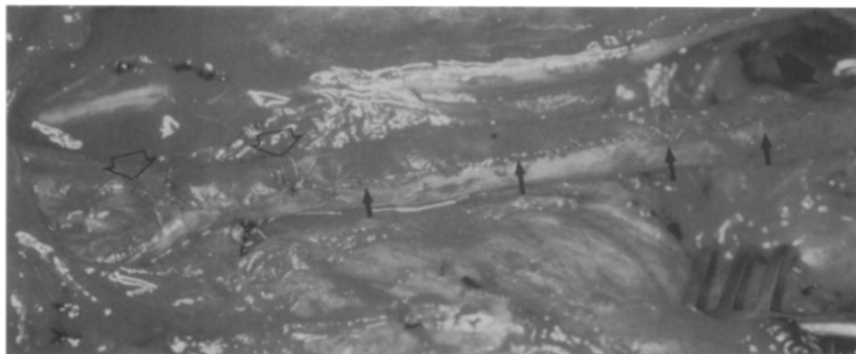
Fig. 3. Intraoperative photograph of long arteriotomy of common carotid artery ( small arrows ). Open arrows point to vein patch angioplasty of the external carotid artery. Solid arrow points to end-to-side vertebral carotid transposition.