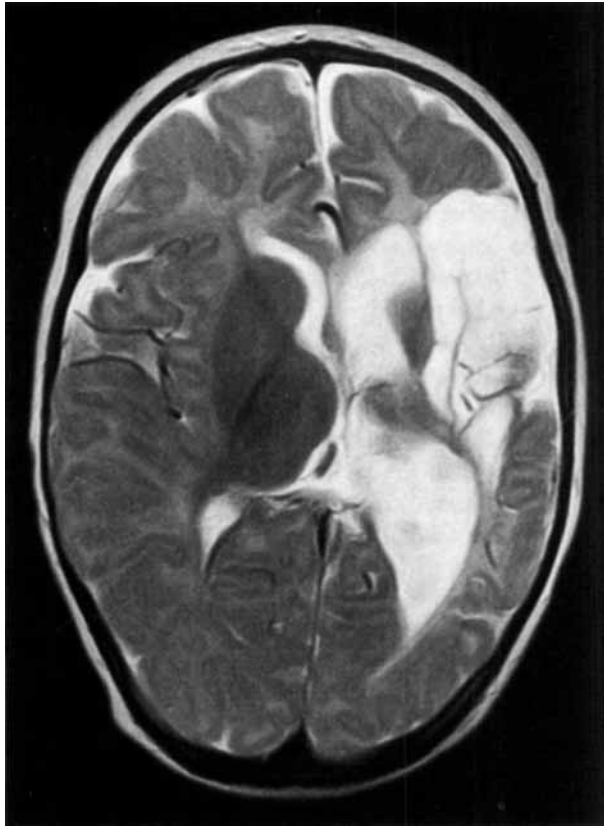
Fig 1. T2-weighted image showing atrophy with ex vacuo dilatation of the body of the lateral ventricle and gliosis in the left frontotemporal region without evidence of blood products. Imaging in other planes confirmed the absence of any communication with the body of the left lateral ventricle. A magnetic resonance angiogram performed concurrently revealed a small left middle cerebral artery.

nance imaging (MRI) of the head performed at 2 years of age disclosed a large left middle cerebral artery distribution area of encephalomalacia involving the frontotemporal region with evidence of gliosis (Fig 1). The patient and his father were heterozygous for the factor V Leiden mutation. The mutation was detected with polymerase chain reaction and the restriction enzyme MnlI as described by Bertina and colleagues [2]. Determinations of complete blood count (CBC), prothrombin time (PT), partial thromboplastin time (PTT), protein C, protein S, antithrombin III, and bleeding time were normal. He was not anticoagulated and has not had subsequent thrombotic events. At 30 months, he has persistent hemiparesis, mild global developmental delay, and intractable seizures.