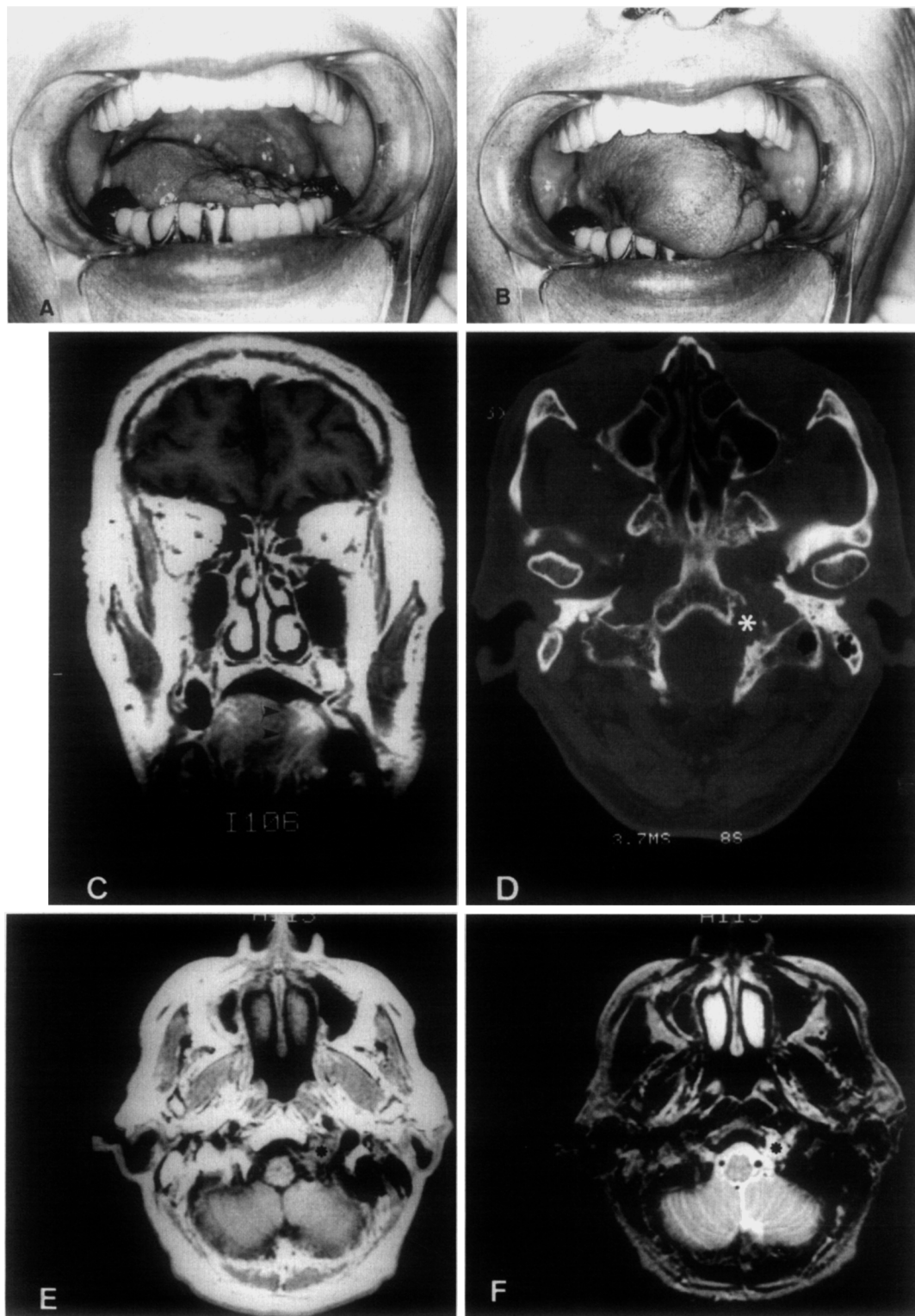
Fig. 1. A , Tongue deviates toward right side at rest. Left-sided hemiatrophy is evident. B , Tongue deviates toward left side on protrusion. C , Coronal T 1 -weighted MR image shows left-sided hemiatrophy and shift of septum to left side ( arrowheads ). Dorsal part of atrophied tongue shows a high signal intensity, similar to that of subdermal fat tissue. D , Axial CT scan shows cortical bone erosion and widening of left hypoglossal canal ( asterisk ). E , Axial T 1 -weighted MR image shows lesion in left hypoglossal canal ( asterisk ). F , Axial T 2 -weighted MR image shows lesion in left hypoglossal canal ( asterisk ).