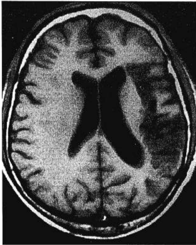
FIGURE 1. Axial T1- and T2-weighted magnetic resonance images show left middle cerebral artery territory infarction. No significant periventricular hyperdensities were noted.

(normal, 0 to 11.9, Roche Laboratories, NC) and free protein S level was decreased at 53% (normal, >78%, Roche). Total protein S was >100% (normal, >79%, Roche). Lupus anticoagulant was negative (Roche). Serum venereal disease research laboratories (VDRL) and antinuclear antibodies (ANA) titers were negative. Protein C antigen and antithrombin III levels were normal. Hemoglobin electrophoresis, lactate levels, lipid profile, and a 24-hour urinary cysteine collection were within normal limits. Liver function tests, renal function, and human immunodeficiency virus (HIV) testing were negative. Serum \alpha -galactosidase levels were normal. Routine cerebrospinal fluid values were within normal limits and no oligoclonal bands were detected. The patient was treated with enalapril, ticlopidine and phenytoin. IgG anticardiolipin antibodies and free protein S deficiency were still present 6 months after the initial testing at 58.4 GPL units and 56%, respectively. At this time, total protein S level was at 90%.