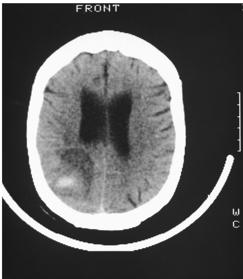
FIG. 2. CT scan showing the haemorrhage which involved the right parietal region.

tests of the Visual Object and Space Perception Battery (Warrington & James, 1991), MF's performance was within normal limits on Dot Counting and just outside the 5% cutoff (17/20) for Position Discrimination (reporting the relative position of objects in two-dimensional space) and Number Location (6/9).