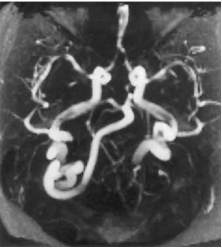
Fig. 2. Three-dimensional TOF-MRA: the basilar artery forms a loop from right to left; the right vertebral artery is also elongated, while the left one is missing.

begin between the ages of 50 and 60, occurring only extremely rarely in children. In three pediatric cases, described in the literature, dolichoectasia of the cerebral arteries was present in the form of fusiform aneurysm [3, 7, 8]; in another case it appeared as an incidental feature of a complex vascular cerebral anomaly [4].