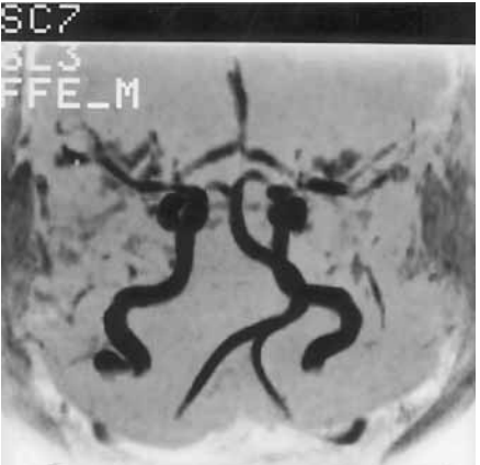
Fig. 4. Three-dimensional TOF-MRA: the basilar artery is elongated, forming a large left-convex bend.

attacks were reported. In July 1992 and 1994, R. suffered two attacks similar to those described above. Following an increase in the dosage of carbamazepine to 500 mg/day, the symptoms disappeared.